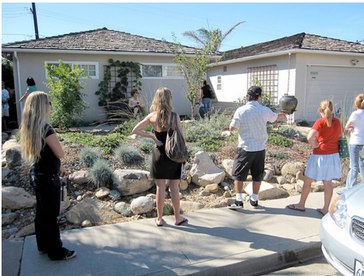
Previous Lawn Patrol

We'll walk the neighborhood, using OFG Sign Criteria to see who has OFG elements. We'll leave behind a flyer for those close to being OFG and see if they want help. Come join the tour, or let us know if you would like us to stop at your yard and provide tips for your landscape!