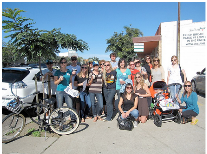
Previous Lawn Patrol

Bring: water, sunscreen, clipboard and pen or pencil